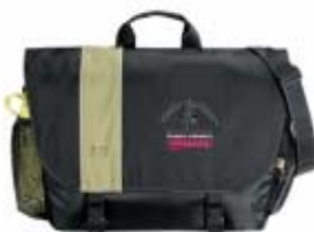
Eco friendly bag made from post-consumer recycled mate-

Master Gardener apparel and other items is now available online! Hats, shirts, bags, pens, pencils, - even gardening gloves—can be purchased by clicking on the Master Gardener Shop on the state website. The website was created by vendor Frontier Business Forms & Promotional Products. Prices are about the same and even less in some cases than the previous items we used to offer. In addition,