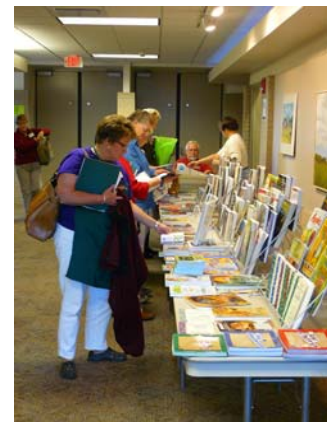
Master Gardeners at the 2007 State Conference in Fergus Falls,