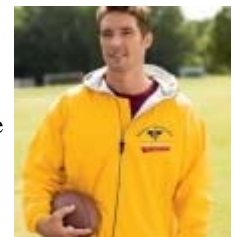
Fleeced-lined hooded jacket

off the order form and mail it to Frontier with a check. County groups can also be billed for the items when ordered by a county coordinator.